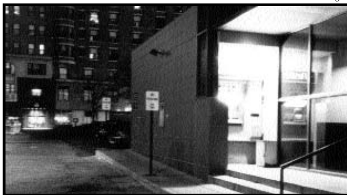
This ATM, located in a poorly lit alley and next to a wall that obstructs the user's side view, does not allow for good visibility.