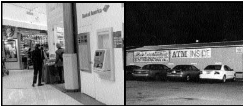
ATMs have been installed in many locations such as this shopping mall and nightclub.