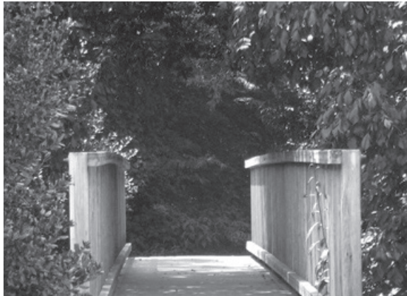
Dense tree and shrub planting that obscures the view from open spaces may encourage misuse and pose threats to pedestrians using footpaths.

In contrast, here are some good design features the Nottingham graphic identify: